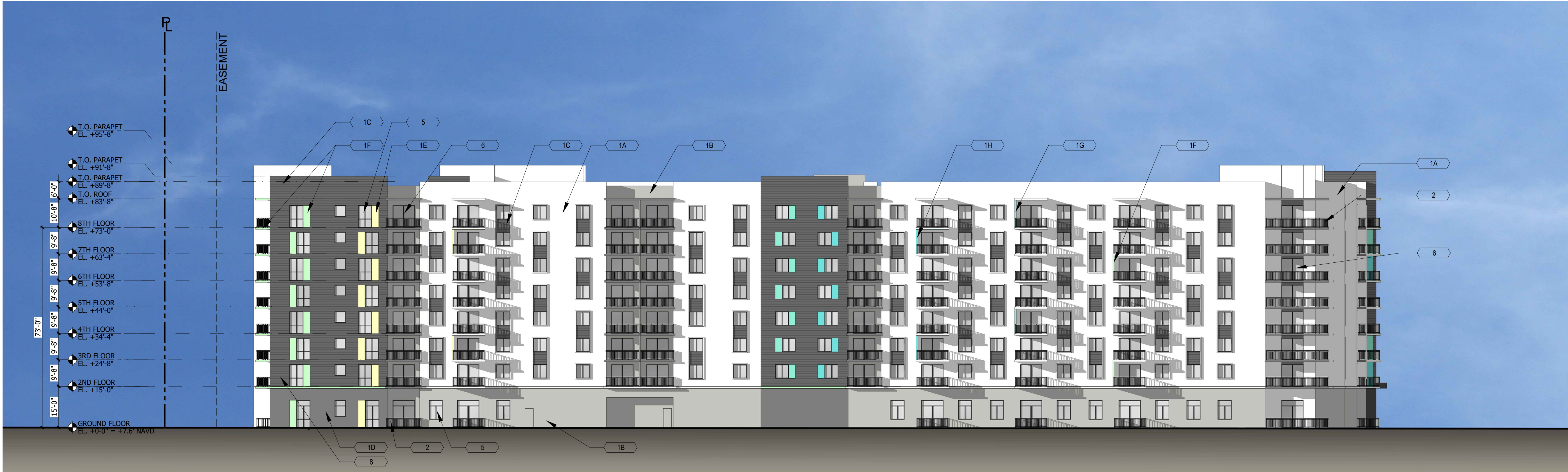
1 NORTH ELEVATION SCALE: 1"=20'-0"