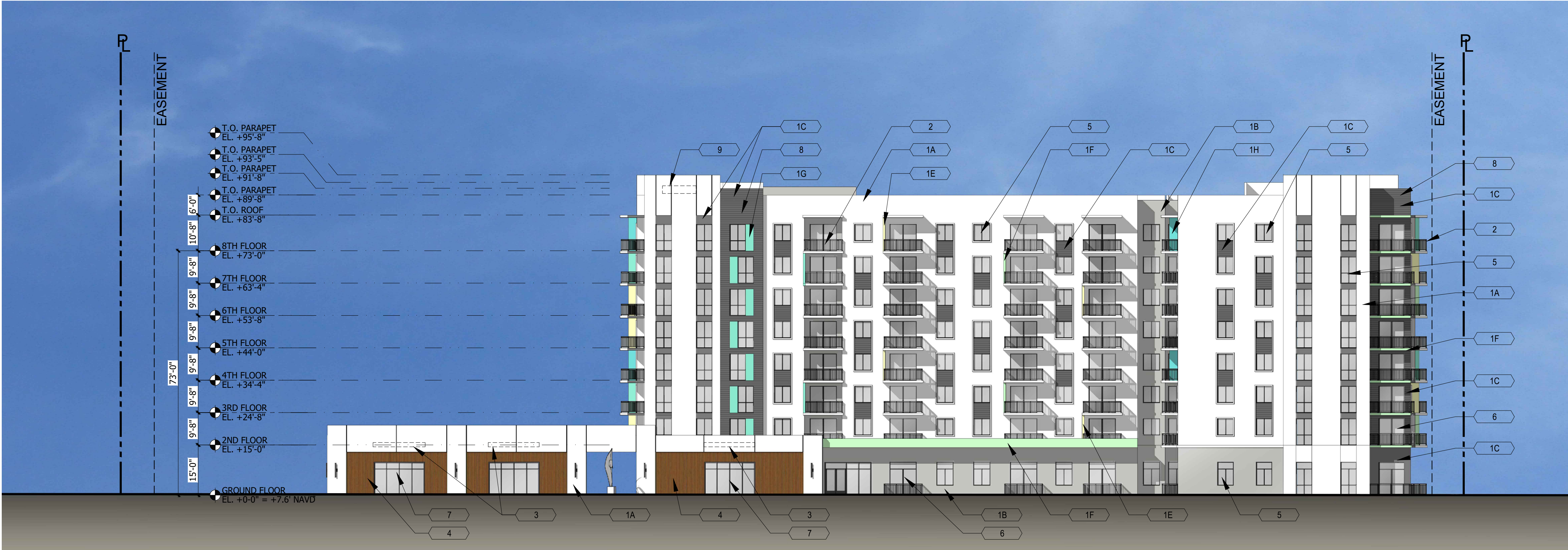
2 EAST ELEVATION SCALE: 1"=20'-0"